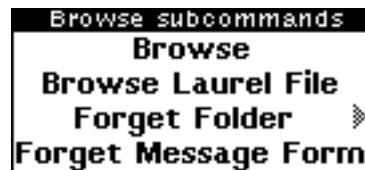
Figure 12. The middle-button Browse menu, showing the options for browsing files and deleting menu items

You can remove a folder from the Browse menu by invoking the Browse command with the middle mouse button. The resulting menu provides four options: Browse, Forget Folder, Forget Message Form, and Browse Laurel File (see figure 12). Browse Laurel File can be used only within Xerox. The Browse command is the same as the one in the Lafite status window, and the Forget Form command is discussed in chapter 9, "Writing Messages." To use the Forget Folder command, simply click on it with the left mouse button and select the folder you want to remove with the same mouse button. The Interlisp-D prompt window will tell you that the folder has been forgotten.