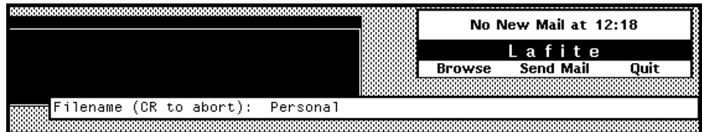
Figure 11. The prompt window for creating a new mail folder from the status window. The user first selected the Browse command, then the Other Folder item from the folder menu

A new folder is automatically created if you ask to move mail into a folder that doesn’t exist yet. You can also create a new folder without using the Move To command. Click on the Browse command from the Lafite status window and select “Other Folder” from the menu that appears. A small prompt window will appear with the prompt “FILENAME (CR to abort)” (see figure 11). Type the desired name of the folder and press the carriage return. If no folder of that name already exists, Lafite prompts you to confirm that you want a new folder, to make sure that you didn’t merely mistype the name of an existing folder: “Click LEFT to confirm creating FOLDERNAME .” If you click the left mouse button, Lafite will create the folder and prompt you to shape a browser window for the folder by showing a rectangle of dashed lines. The browser’s table of contents will initially be blank, and the prompt region will report “Folder is empty.” You can now retrieve new mail to this folder, using the Get Mail command, or move messages into it from another folder, as described above.