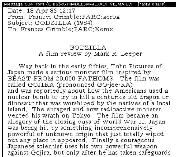
Figure 5. A message display window, showing the title bar and the message display region. The message display window lacks the message composition window's prompt region, command menu, and TEdit pop-up menus; you cannot use it for editing

To examine the next message listed in the table of contents, click on Display again. The selection pointer will move to the next entry, and this message will replace the previous one in the message display window. Lafite will skip over deleted messages when advancing the selection pointer. To display a deleted message you must select it explicitly, then click on Display.