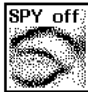
Figure 19.1. SPY Window When SPY is Not Being Used

The function SPY.BUTTON brings up a small window which you will be prompted to position. Using the mouse buttons in this window controls the action of the SPY program. When you are not using SPY, the window appears as in Figure 19.1.