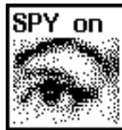
Figure 19.2. SPY Window When SPY is Being Used

To use SPY, click either the left or middle mouse button with the mouse cursor in the SPY window. The window will appear as in Figure 19.2, and means that SPY is accumulating data about your program.