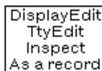
Figure 17-2. Option Window for Inspection of List