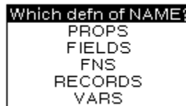
Figure 17-1. Option Window for Inspection of NAME

If NAME has many possible interpretations, an option menu will appear. For example, in Interlisp-D, a litatom can refer to both an atom and a function. For example, if NAME was a record, had a function definition, and had properties on its property list, then the menu would appear as in Figure 17-1.